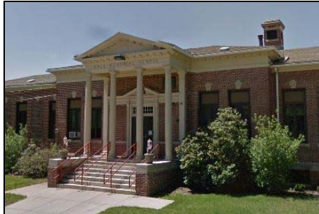
Address Community Facility Issues