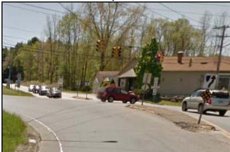
Address Transportation Issues