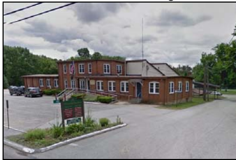
Town Office Building